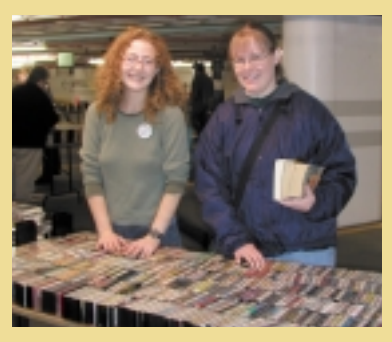
Volunteers at the Annual Book Sale held in the Library Parkade.