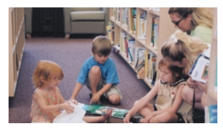
Children reading at a branch library