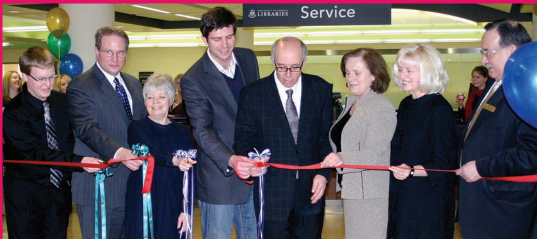
Grand opening of eplGO