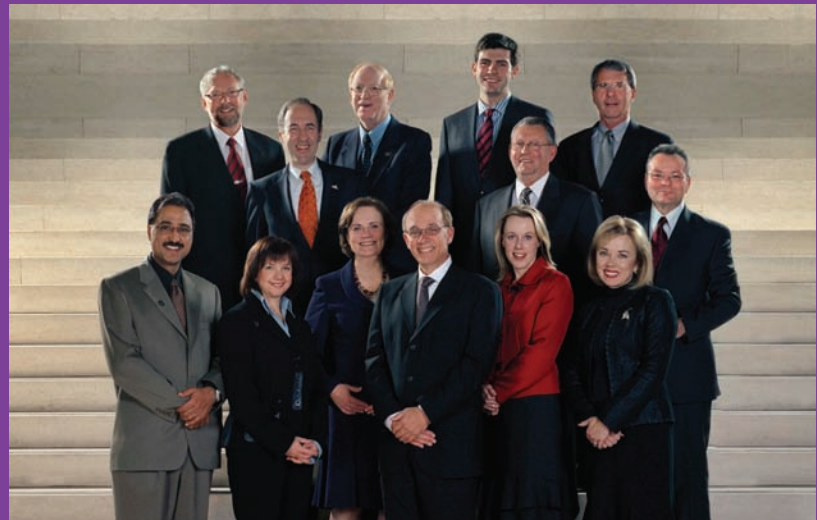
Edmonton City Council