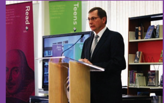
Premier Ed Stelmach announces increased provincial funding

EPL continues to benefit from strong support from City Council. Significant capital funding was approved to allow the Library to not only rehabilitate existing branches, but also expand services into new communities, such as The Meadows.