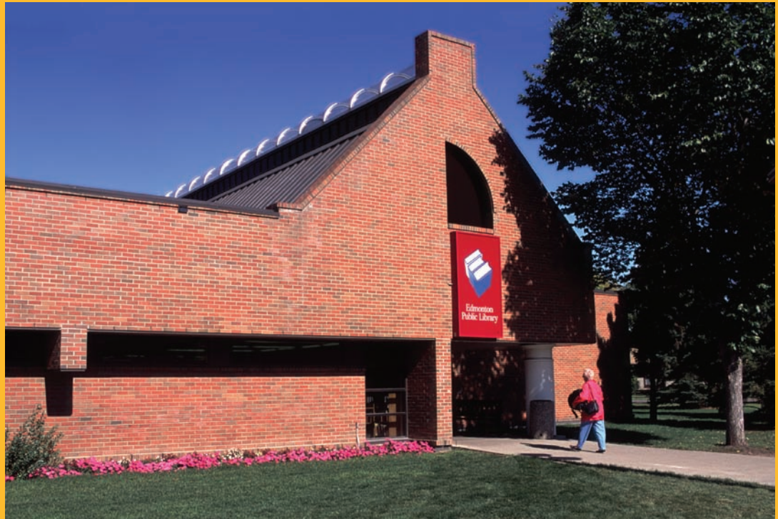
Current Jasper Place Branch

Twenty-one years after its last renovation, design work to replace the Jasper Place Branch got underway. The expanded library will be re-built on its existing location and have an extra 4,000 square feet with improved parking.