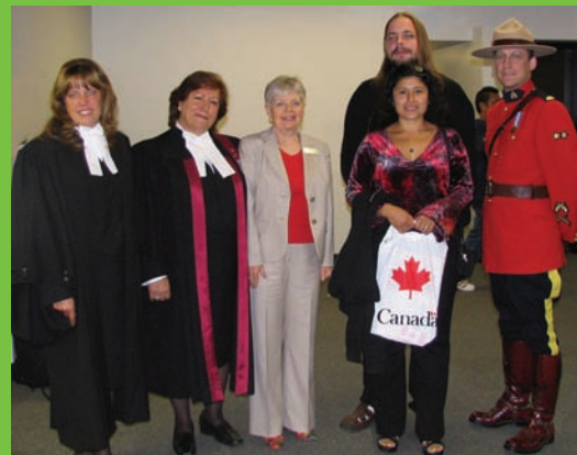
Citizenship ceremony at Stanley A. Milner Library

All EPL locations received Safe Harbour: Respect for All designations after system-wide staff training. Safe Harbour is a national diversity initiative that fosters opportunities for organizations to create safer, more welcoming environments for customers and employees alike, by supporting a diverse workplace and standing up against racism and hatred. The Safe Harbour window decal can be seen at library locations across the city, reinforcing EPL's reputation as a safe and welcoming place for everyone.