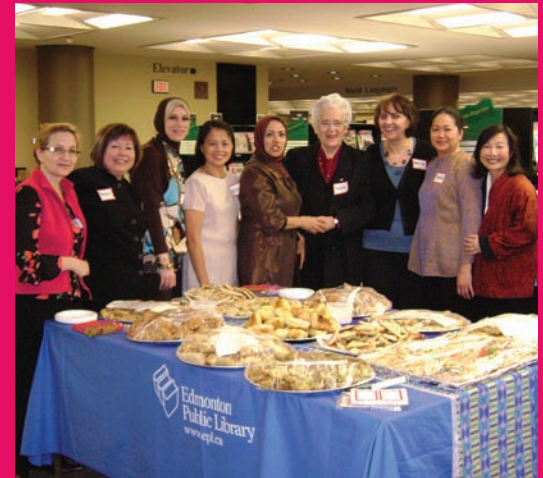
EPL and Multicultural Health Brokers official partnership signing

With funding from Citizenship and Immigration Canada and a new partnership with Edmonton Immigration Services Association, the Library Settlement Practitioner Program has become one of the touchstones to connect with newcomers. EPL's Settlement Practitioner worked with more than 500 clients at the Stanley A. Milner Library, Mill Woods branch and Londonderry branch, collaborating with EPL staff to develop library services and programs that addressed newcomers' specific needs.