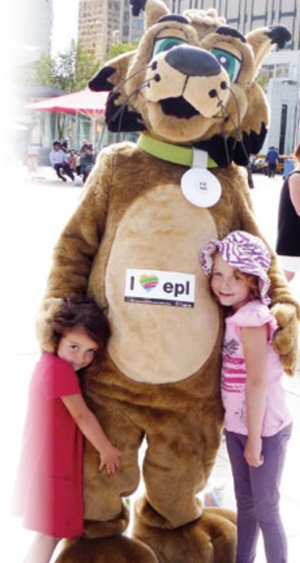
The EPL Lynx out making friends