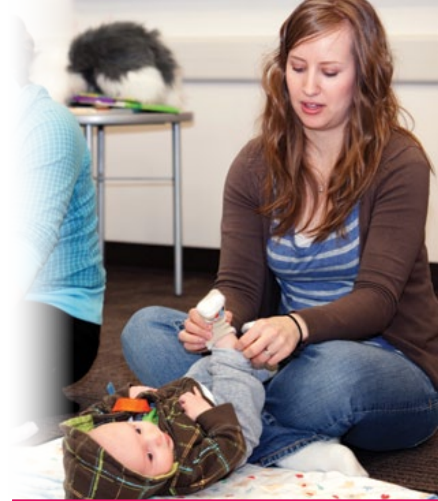
2,733 Welcome Baby signups in 2011, a 26% increase from previous year