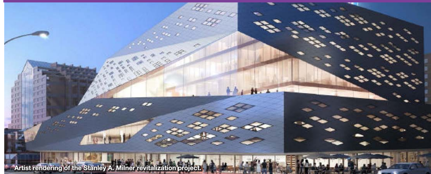
Artist rendering of the Stanley A. Milner revitalization project.

14.2 MILLION VIRTUAL AND IN PERSON VISITS IN 2013