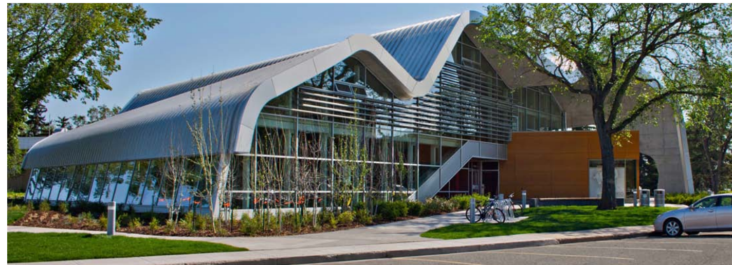
The new Jasper Place Library.